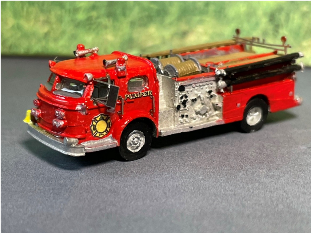
N-Circle_22-10-07 GHQ FireTrucks 7